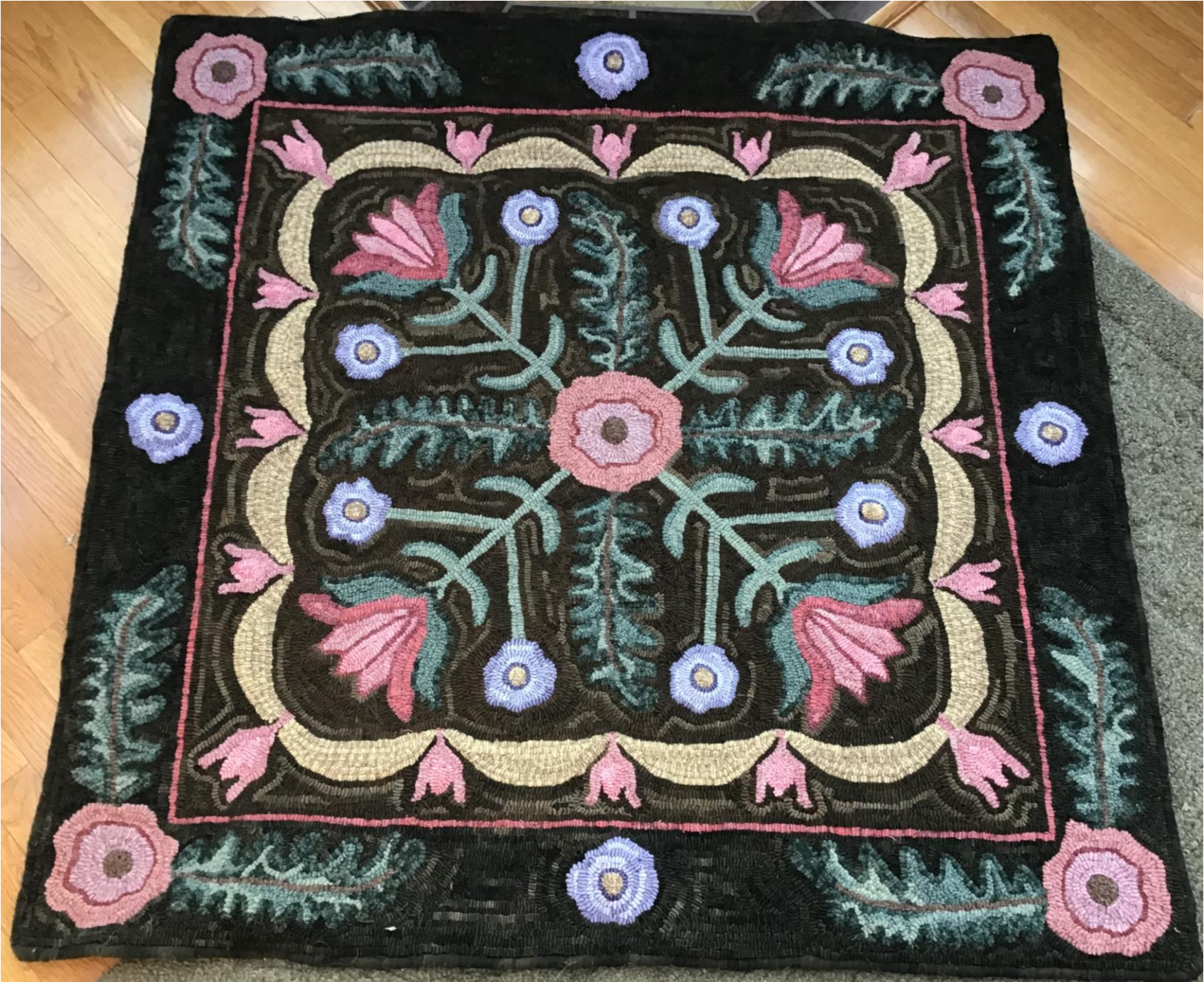
Emma Lou Lais pattern, Tulip Cross