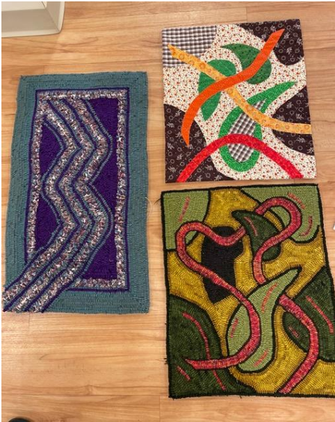
Six Small rugs by Bonnie Floyd