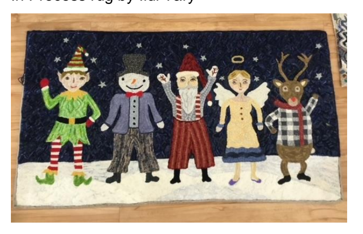
In Process rug by Ildi Tary