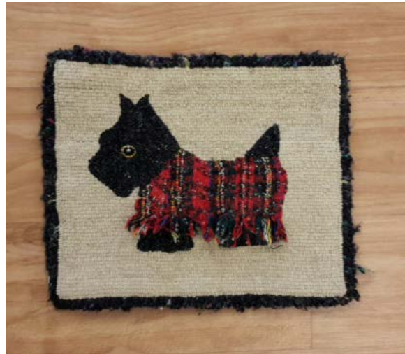
Scottie Dog by Jeannie Crockett, using a technique that included creating plaid: