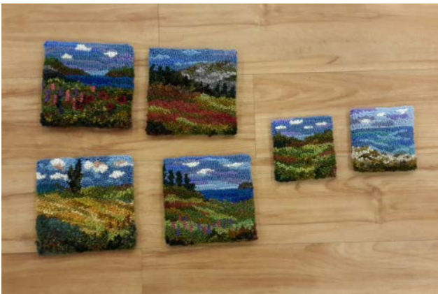
Series of landscape mats by Marcia Kent: