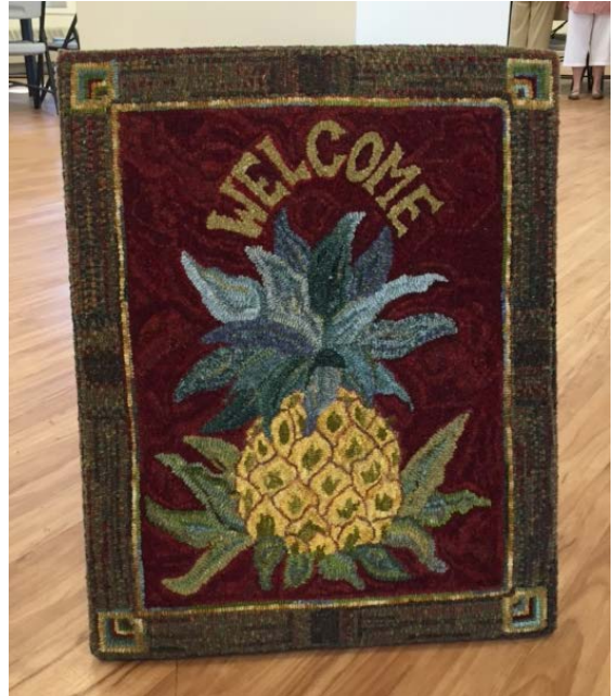
Welcome Sign by Sandra Porter: