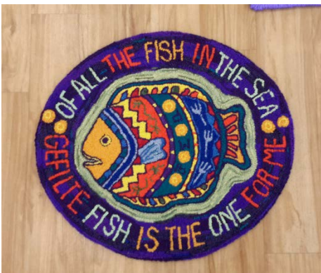
Fish In the Sea by Dot Woodle: