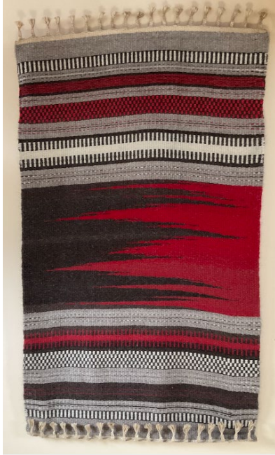
Woven rug and knitted coverlet. Gorgeous!