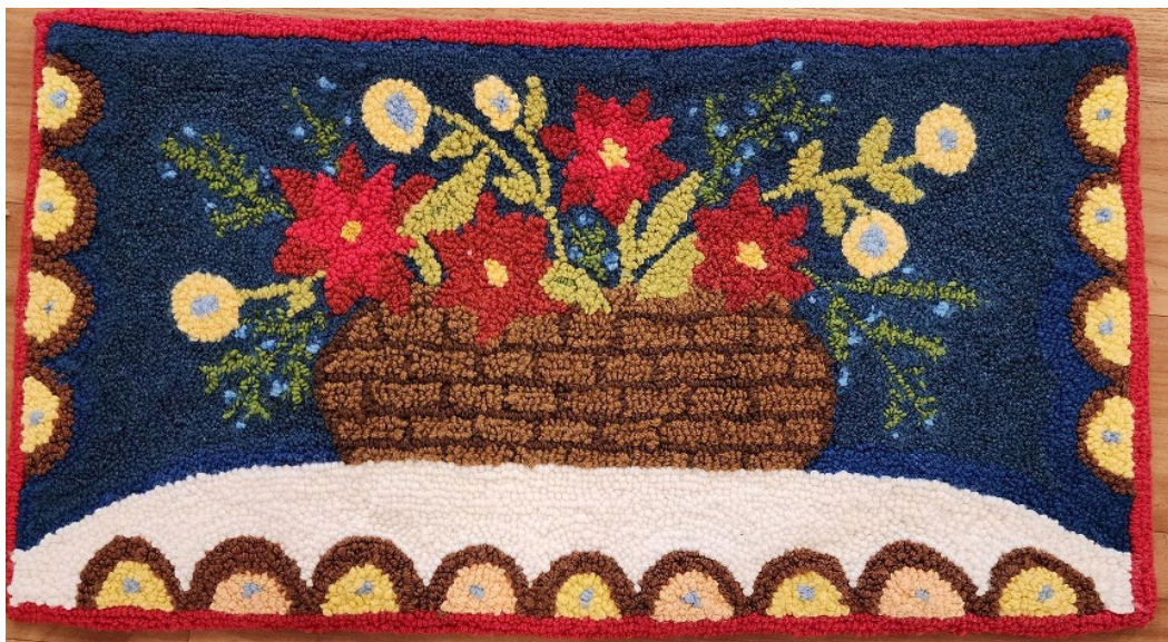
Rug hooked with yarns by Lin Fields