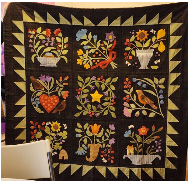
Wool applique quilt