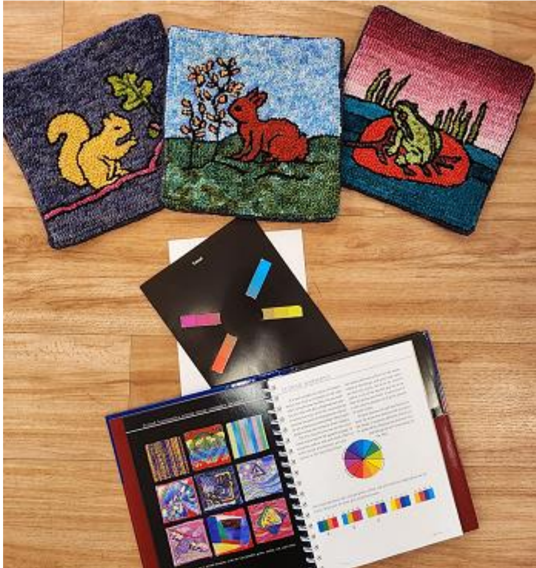
Donna Allen did all 3 animals and did each one using a different triptych color scheme