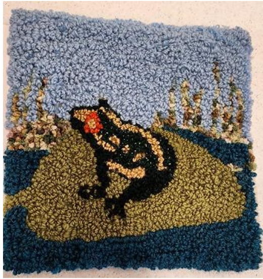
Lin Fields' froggie