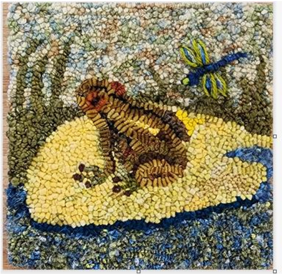
Jane Sittnick's mat. Love the dragonfly!