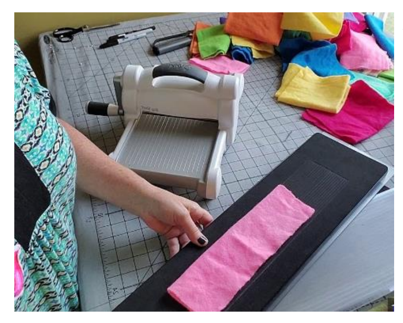
Tina also demonstrated how to use a Sizzix machine to cut wool strips (regrettably, I failed to get a picture of Tina doing her demo, so this is a stock picture)