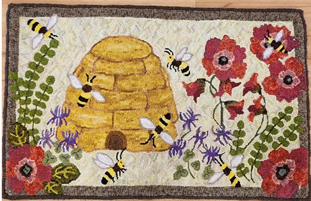
two rugs by Ildi Tary