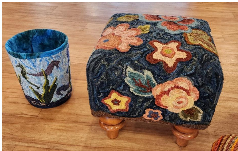
Wastebasket: Tina Carrick