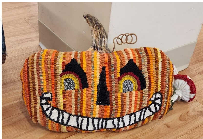
Pumpkin: Catherine Flowers